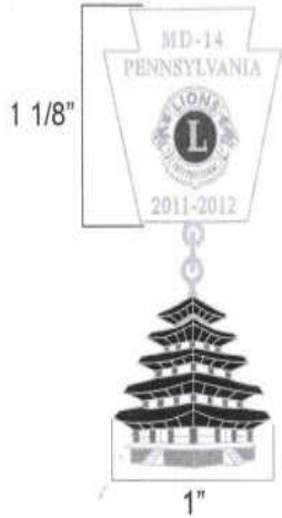
The 2011-2012 Gold Pin with the Pagoda